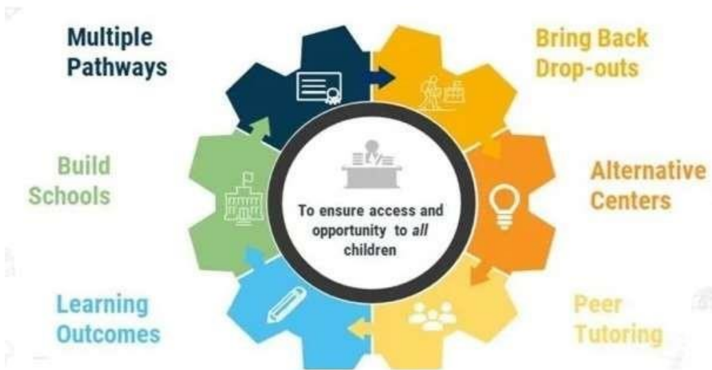
Figure 2 Graphical Representation of NEP 2020 for Universities Outcome [3]