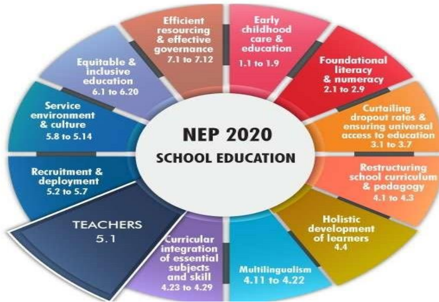
Figure 1 Graphical View of National Educational Policy 2020 [7]